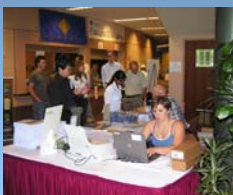
ACS & AAAS Registrations

Featured symposia and events included Public Response to Chemical Exposure Emergencies, Women Chemists Committee symposium and networking luncheon, and special programming for undergraduate students & high school teachers.