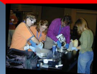
"Liquid Nitrogen" ice cream social

Richland & Snake River Sections hosted the 62nd Northwest Regional Meeting of the ACS (NORM 2007); held in Boise, Idaho on June 17-20, 2007, and hosted concurrently with the Pacific Division of the AAAS.