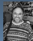
Region Award Winners