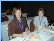
Professional Analytical Chemists in Industry Workshop (sponsored by Proctor & Gamble)