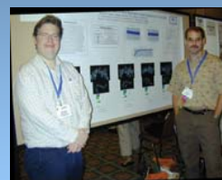
Undergraduate Poster session