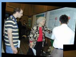
Mixer and poster session