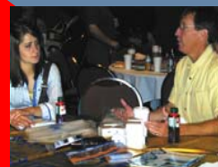
Graduate School Recruiting breakfast