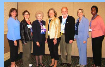
WCC Symposium Speakers & ACS Governance Attendees